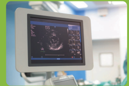
Embedded industrial applications