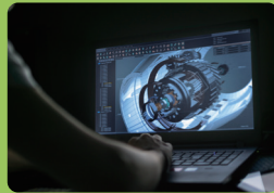
Professional graphics users